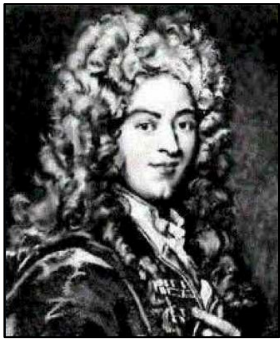
Guillaume le Gentil 1725 - 1792

The next pair of transits after Halley's proposal was 1761/1769. Halley himself was no longer alive but astronomers, remembering his proposal, dispersed themselves around the globe to such far-ranging sites as Siberia, Mexico, and the South Pacific. There were good results – the distance was determined to be 95 million miles, which is not far from the modern value of about 93 million miles – but the real stories to me are the arduous adventures that several astronomers experienced in their quest; one story that stands out is the series of misadventures that plagued the French astronomer Guillaume le Gentil.